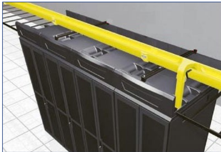
Figure 3: ISP Pathways

Inside Plant Pathways (ISP) can hold thousands of strands of fiber and are commonly aggregated in Data Center facilities for efficiency and to conserve space. These run along conduits near the ceilings above or in meet me rooms throughout the facility. These bundled cables are then distributed to other parts of the Data Center holding critical customer shared infrastructure or to individual cages leased by Colo customers.