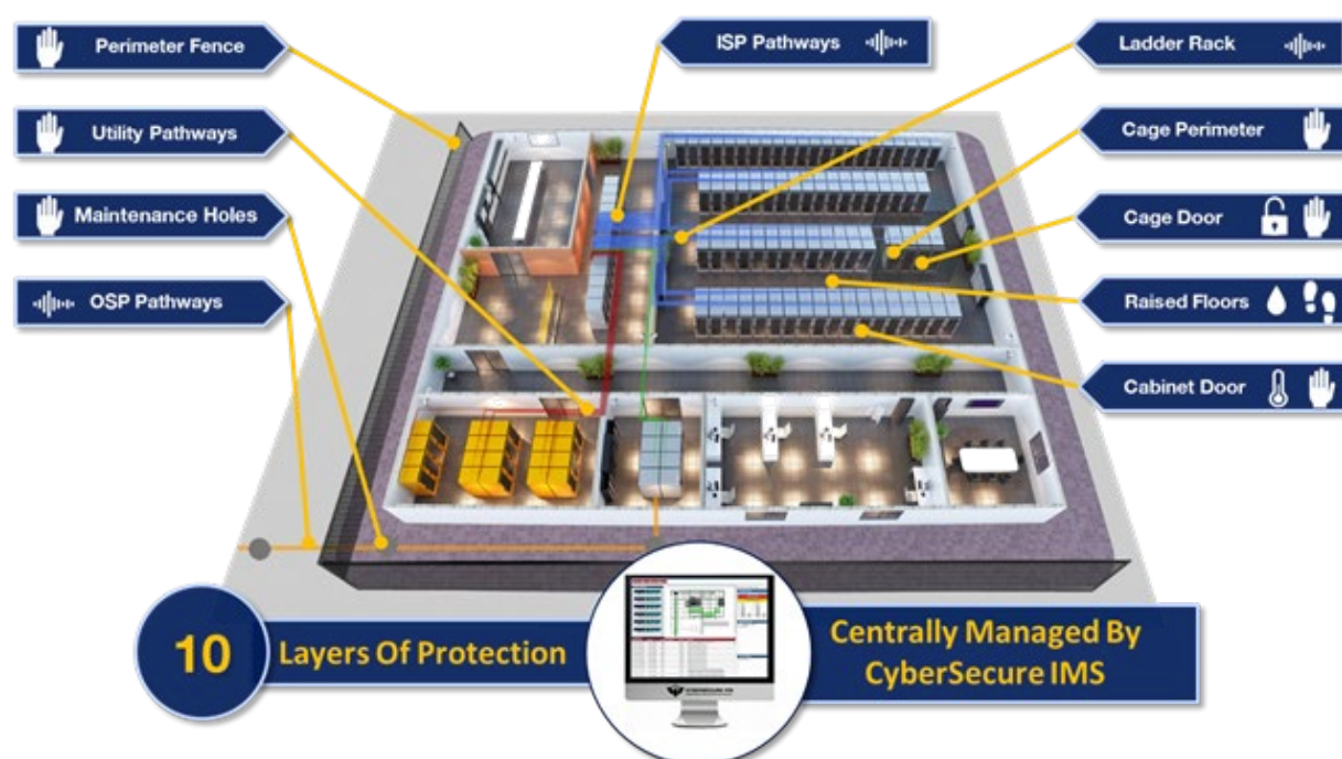
Figure 1: Data Center Protection Suite

To address the ever-present insider threat, CyberSecure IPS utilizes their DoD-grade fiber sensing technology for the Data Center industry to create the Data Center Protection Suite.